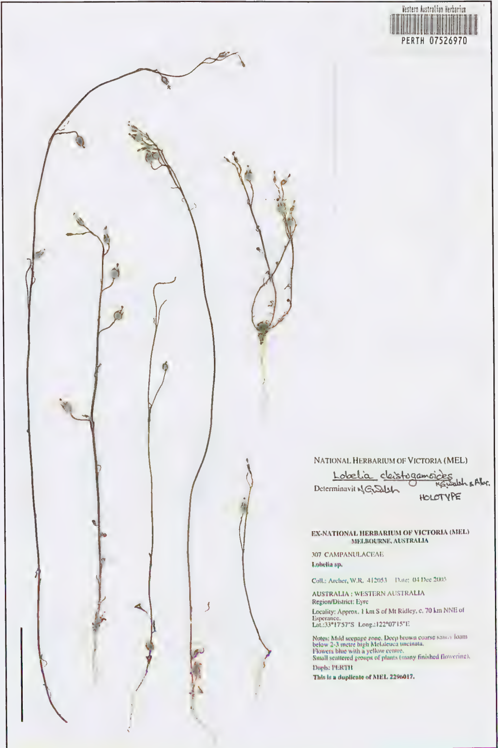
Figure 1. Holotype of Lobelia cleistogamoides (W.R. Archer 412053). Scale = 5 cm.